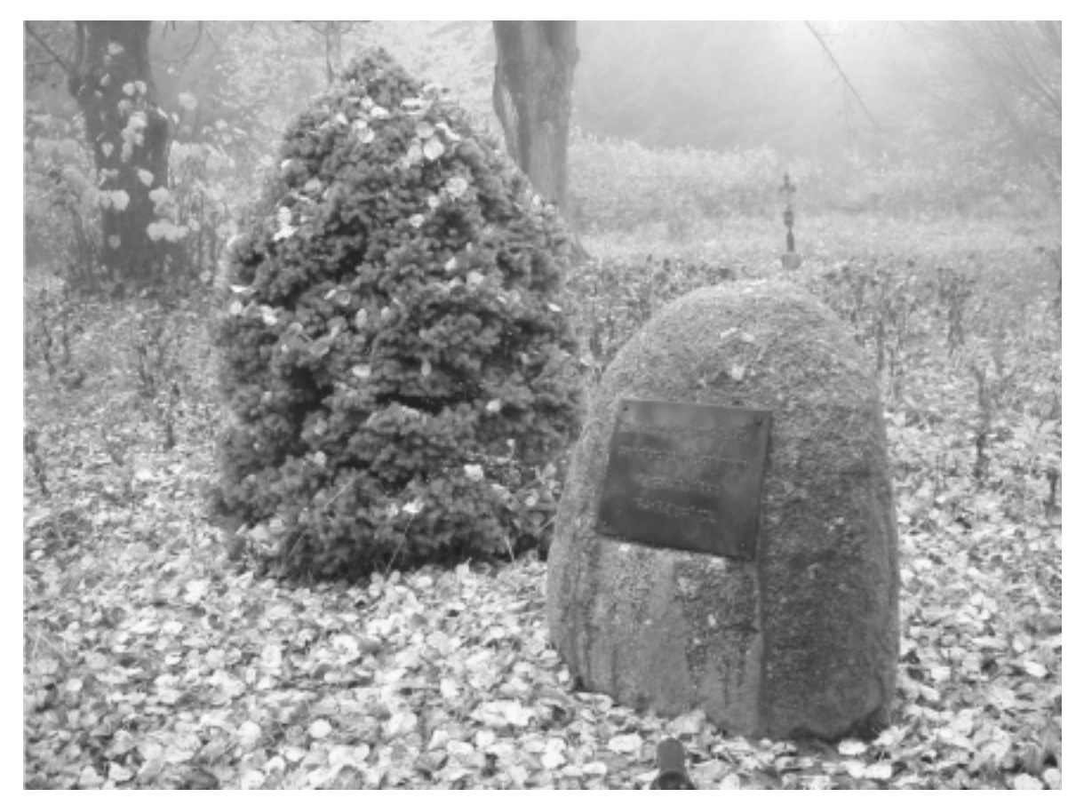
Fig. 10. Forty years after. This stone commemorates a visit in 1985 by some former inmates of the Oflag. The French prisoners had their own graveyard in Edelbach, complete with funeral statue.

ness of solutions of the initial-value problem for the three-dimensional Navier-Stokes equations for incompressible fluids. He showed, in partic-