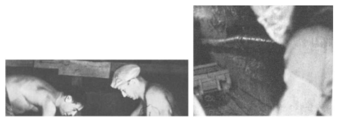
Fig. 7. Underground film. These clandestine stills show the escape tunnel, also known as métro pour la liberté . The clandestine movie Sous le drapeau , shot in real time, is a French alternative to Hollywood's The Great Escape [Corr 1954].

a candidate for that same chair at the Collège de France ). In an obituary written for Nature , Ivar Ekeland called Leray "the first modern analyst," and compared him with Weil, "the first modern algebraist" [Eke 1999].