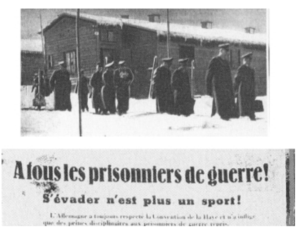
Fig. 8. Cold feet and frosty advice. Unaware of being filmed, a Wehrmacht delegation decided to keep the news of the escape under wraps. But posters warned the French that henceforth, s'évader n'est plus un sport.

Changing direction seems to have posed no problem for Leray. "The essential characteristic of my publications is their diversity," he later said, simply. "It was my interest in mechanics that obliged me to give new developments to mathematical analysis and algebraic topology" [Sch 1990]. Indeed, Leray had been interested in topology even before the war, but as a tool rather than as an end in itself. The homotopy invariant now known as the Leray-Schauder degree was created in