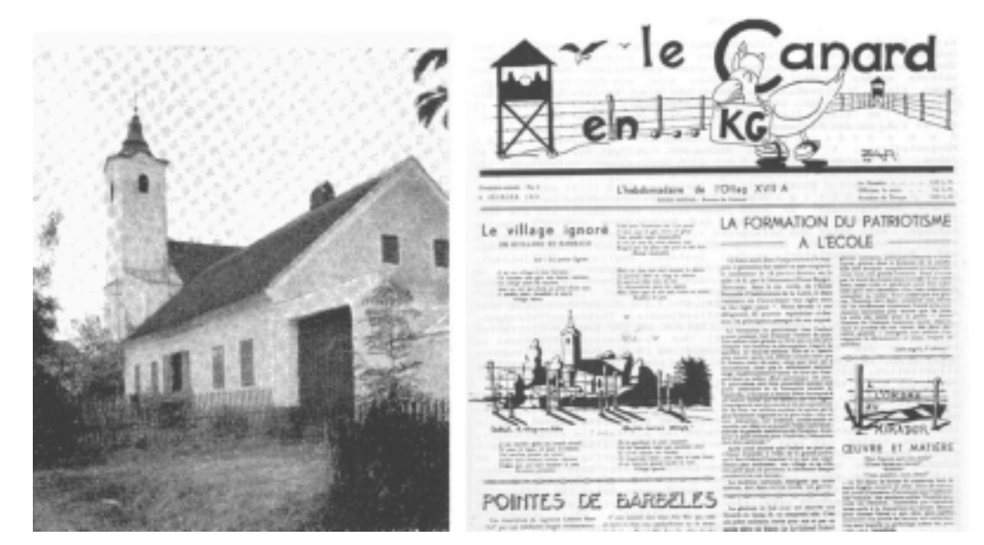
Fig. 9. The church of Edelbach, in an already deserted village. The poem laments that in the humble church, no bell ever rings. In 1957 the church was flattened by Austrian artillery.

order to prove the existence of solutions to non-linear partial-differential equations. Such equations, particularly those which stemmed from mathemat-