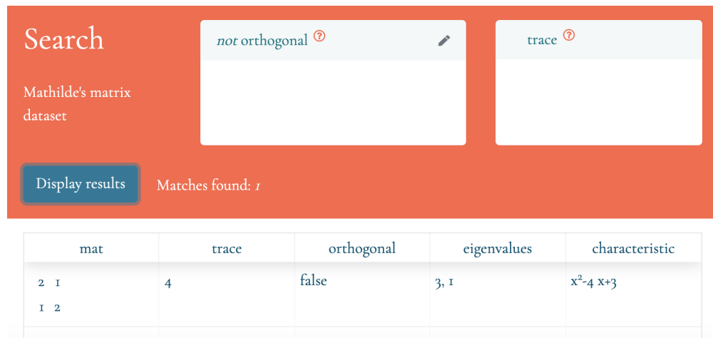
Figure 1: Screenshot of the website for Mathilde's use dataset

Extensions and Customisation Mathilde can modify the code and the database after they are generated and before running or deploying the website. We use the project wiki [7] to document how such modifications can be made.